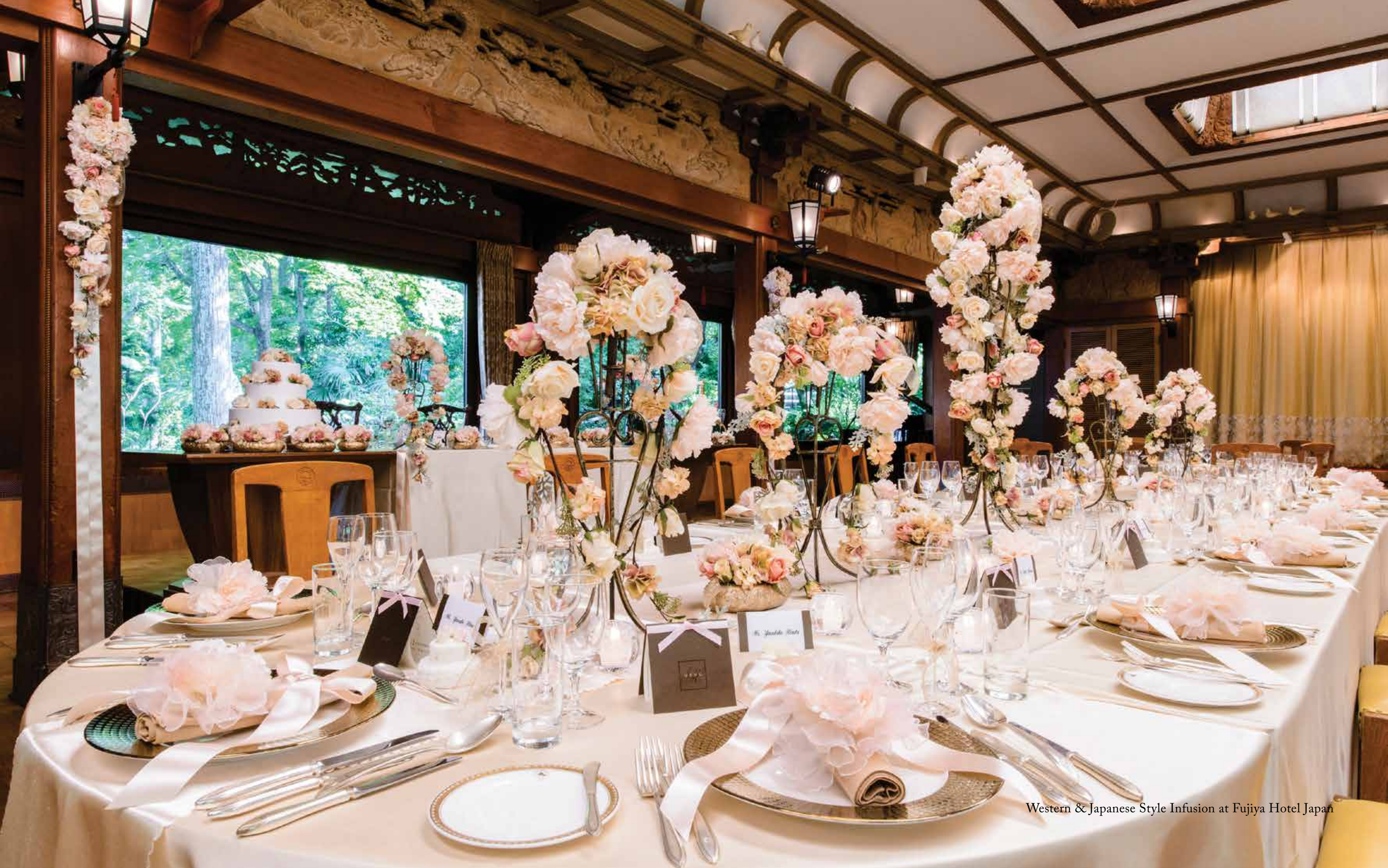
Western & Japanese Style Infusion at Fujiya Hotel Japan